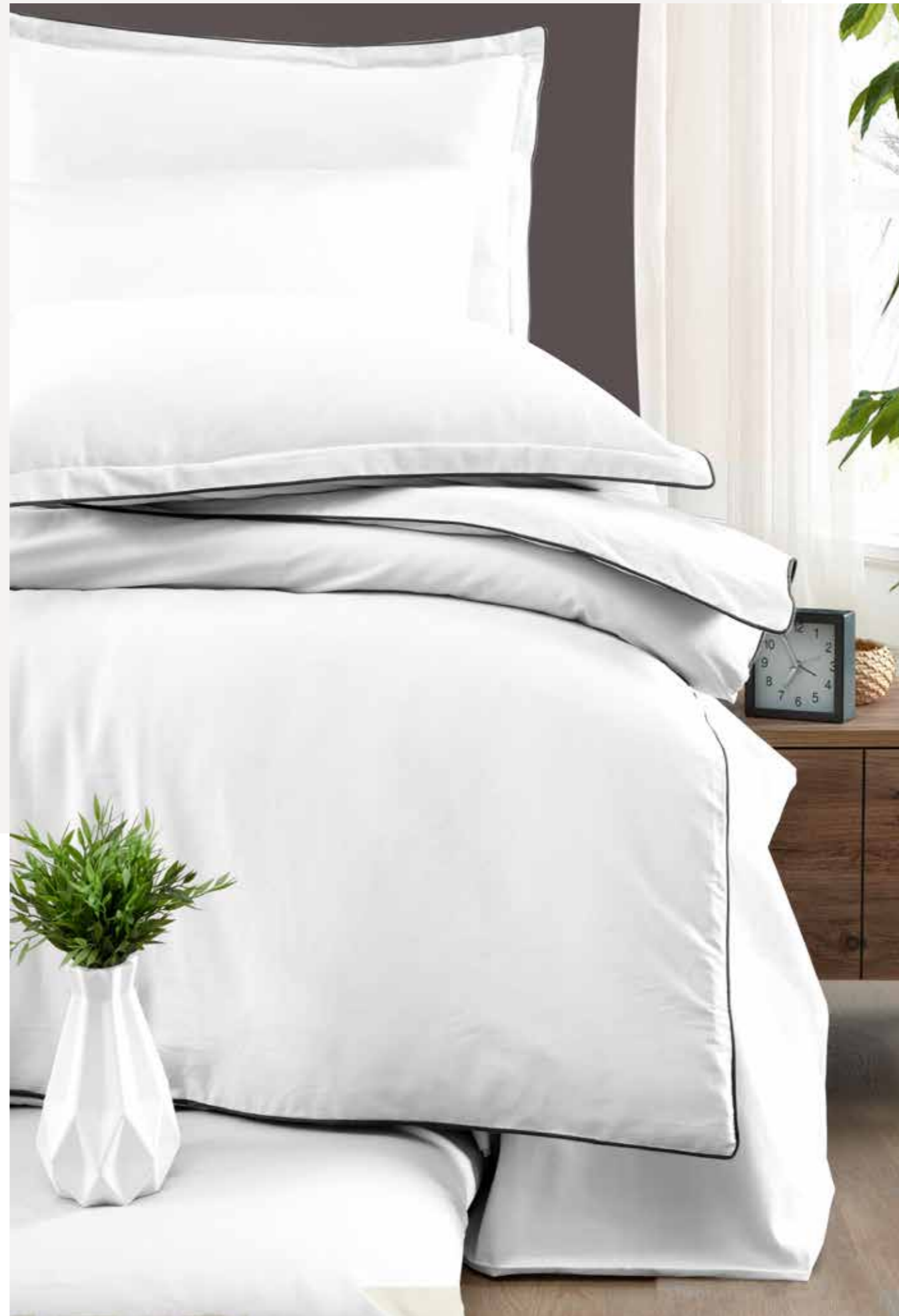
Lucca White PR616